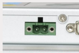
Phoenix terminal using fastening type power connector