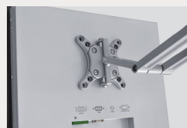
Supports VESA wall mount