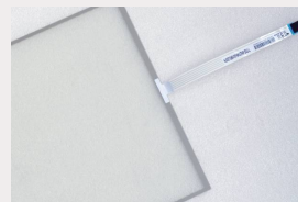
Using precision resistive touch screen