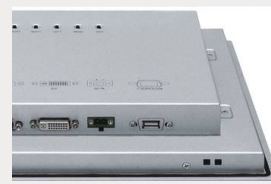
Rugged steel structure