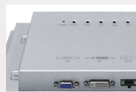
Control buttons on the rear panel