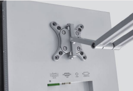
Supports VESA wall mount