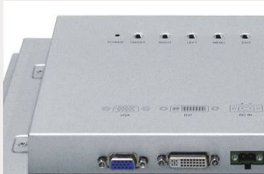
OSD control buttons on the rear panel