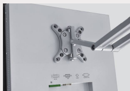
Supports VESA wall mount