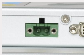
Phoenix terminal using fastening type power connector