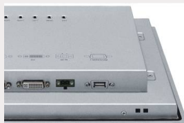
Rugged steel structure