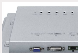
OSD control buttons on the rear panel