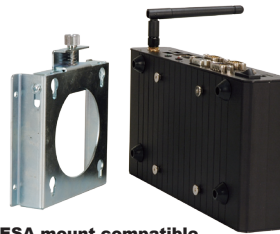
VESA mount compatible (mounting kit included)