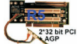
R5: 2 x32 bit PCI + AGP