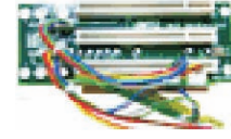
R3: 3 x 32 bit PCI