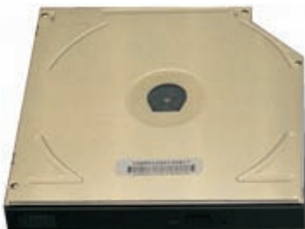
Slim CD ROM