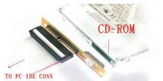
TO PC IDE CONN