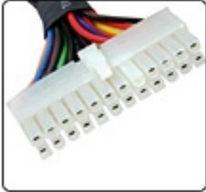
ATX 24 pins main power connector x1