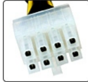
8 Pin CPU Power connector x 1