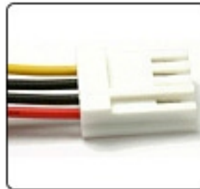
Floppy connector x 1