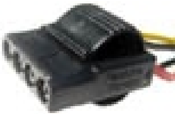
4 Pins Power connector x 6