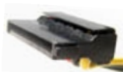
5 pins SATA connector x 2