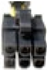
6 pin PCI Express power connector x 2