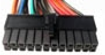
ATX 20 +4 pins main power connector x1