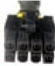
8 pin Processor Power connector x 1